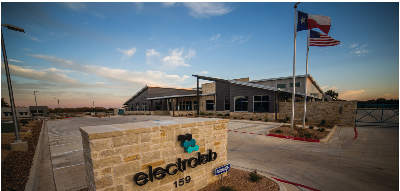
Electrolab Corporate Headquarters

Let Electrolab put our experience to work for you!